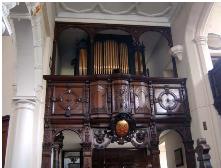
The Chapel, Charterhouse – The Organ